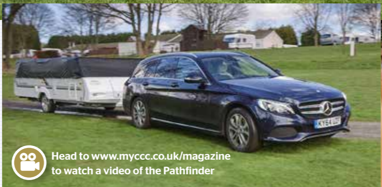
Head to www.myccc.co.uk/magazine to watch a video of the Pathfinder